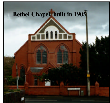
Bethel Chapel, built in 1905

See History of Deganwy Group's website for more information on Deganwy www.deganwyarchive.co.uk